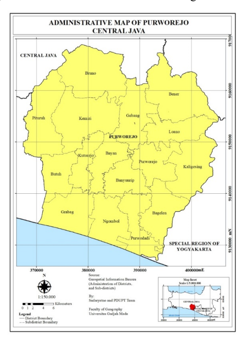
Figure 1. Research Area Map

The study area is Purworejo as shown at figure 1 below. Purworejo as Regency in the part of Central Java Province was due to the fact that in the last five years from 2014 to April 2019 have some 65 landslide with the most enormous years of the event is 2019 or have 15 landslide occurrence (Indonesian Disaster Information Data, 2019)<sup>[2]</sup>. Administratively the Purworejo district consists of 16 sub-districts, which are divided into 494 villages. Geographically, Purworejo Regency is located in the south-central part of Java Island, more precisely located at 8° 30 '- 7° 20' South Latitude, and 109° 47' 28"- 111°8' 20" East Longitude