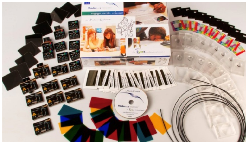
Figure 2. Photonics Explorer Kit has been developed by an international team of teachers and experts in pedagogy from 11 EU countries to fit into diverse educational systems, as part of an FP7 European project. It was disseminated to more than 900 high schools throughout Europe.

The Optics Group also sustains a permanent exhibition about optics research in the Science Centre of Delft University of Technology. In October this year during the so called "Days of Science" a special holography exhibition will be organized. Last but not least the Optics Group is always present at the annual conference of high school teachers, where group members demonstrate educational kits (Fig. 4).