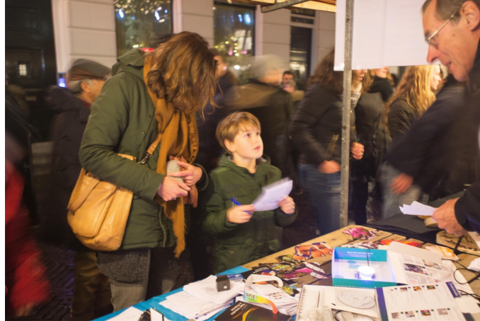
Figure 3. Optics booth at the public market shortly before Christmas in Delft.