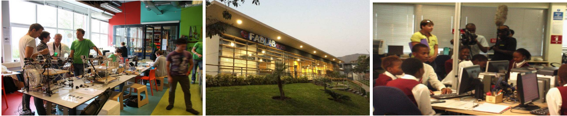
Figure 5. Fab Labs in Long Island (New York), Lima (Peru) and in South Africa (from left to right).

Fab Lab are between $50,000 and $100,000. Additional costs are for renting appropriate space and for technical supervisors. Funding can have quite diverse origins. In Europe funding is often provided by local municipalities. The number of Fab Labs is increasing very fast and there are now more than 1100 worldwide with around 80 in the U.S., 32 in The Netherlands and 11 in China. Fab labs are important to increase interest among young students for science and technology 6,7