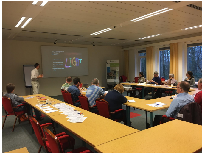
Figure 4. Demonstrating optical kits to high school teachers.