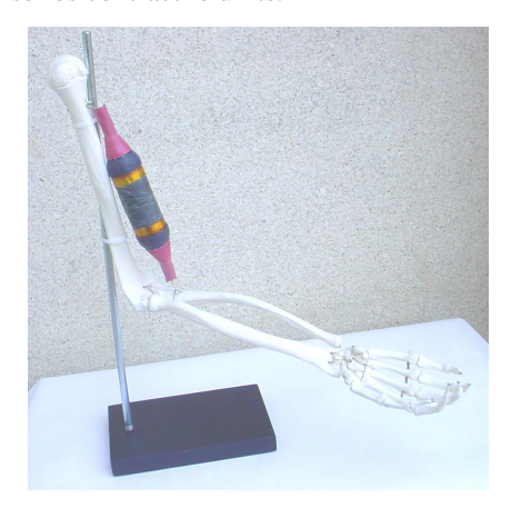
Fig. 3. Rolled dielectric elastomer acting as a bicep on a full-size human skeletal muscle. Field-activated polymers operate at high voltage and low current. Further development of lightweight and efficient voltage conversion and driving circuitry is required for operation off of batteries. High voltage must be isolated from the user. However, the potential danger of high voltage can be greatly reduced by limiting the available current. For example, operation of 100 W actuators at 5000 V (a typical maximum for dielectric elastomers) would require just 20 mA —a nonlethal amount.

Dielectric elastomer actuators have already shown some promise as artificial muscles for O&P devices. These actuators have been formed into cylindrical rolls that have strain, shape, and performance similar to natural skeletal muscles. Such actuators have been demonstrated acting as biceps on a life-size skeletal arm, although the particular actuator was smaller than would finally be desired. Figure 3 shows a photo of this device. These smaller actuators can be grouped to increase the stroke and force, much as individual muscles are composed of parallel fibers that in turn are made up of series contractile units.