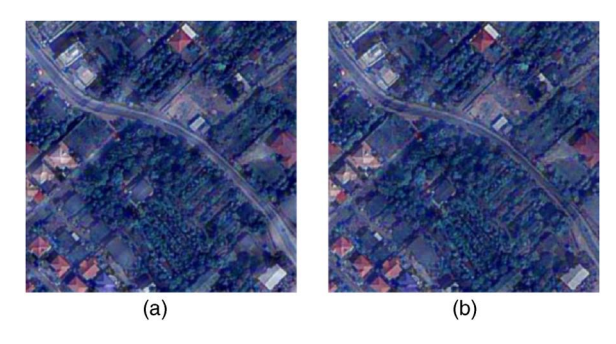
Fig. 3 Comparison of experimental results: (a) wavelet-based fusion method, (b) proposed fusion method.