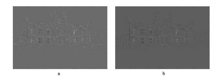
Fig. 3 (a) All the high frequencies of the image in Fig. 1. (b) The corresponding salient high frequencies.

This paper presents a modified version of the unsharp masking method that makes it possible to reduce the sharpening sensitivity to noise and also due to digitization effects and compression. Moreover, being based on a neurodynamical model of human visual attention, the processed images appear more natural and pleasing to observers. The preliminary experimental results on a data set of about 300 images of various subjects with various types of degradations demonstrate that our method has good performance with respect to the traditional unsharp masking combined with smoothing. We plan to investigate further the relationship among user preferences, image content, image defects