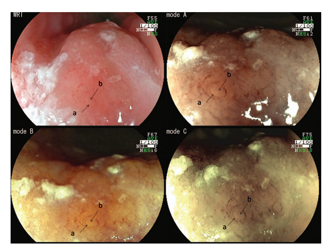
Fig. 2 Observation of flat elevated esophageal cancer by an approximately 50-power magnifying endoscope. White light—color of IPCL (a): (L, a, b) = (50, 41, 29); color of background mucosa (b): (L, a, b) = (65, 29, 20); color difference (\Delta E_{94}) = 15.69 . FICE mode A—color of IPCL (a): (L, a, b) = (28, 30, 28); color of background mucosa (b): (L, a, b) = (53, 23, 28), \Delta E_{94} = 25.25 . FICE mode B—color of IPCL (a): (L, a, b) = (41, 36, 37); color of background mucosa (b): (L, a, b) = (59, 23, 45); \Delta E_{94} = 19.94 . FICE mode C—color of IPCL (a): (L, a, b) = (11, 13, 13); color of background mucosa (b): (L, a, b) = (46, 9, 24); \Delta E_{94} = 36.91 .