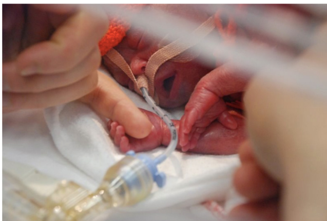
Fig. 1 The ultimate goal is to support preterm infants in an individualized manner during the physiological transition from fetal life. Due to their size and fragility all measures must be carefully adapted to their needs. Cerebral oximetry by NIRS has the potential to detect harmful cerebral hypoxia for timely intervention.

The SafeBoosC-II trial showed that it is indeed possible to reduce the burden of cerebral hypoxia in extremely preterm infants during the first 3 days of life when adding cerebral