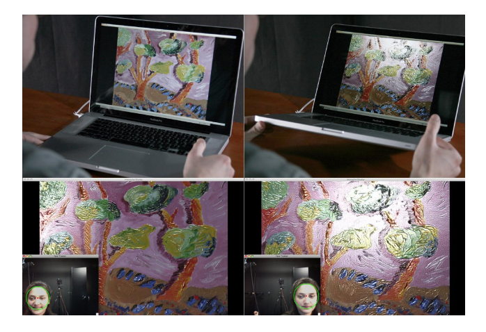
Figure 2: The tangiBook system – tilting the display (top row) or moving in front of it (bottom row) produces realistic changes in the appearance of the rendered surface.

Since we were engaged in a project to create rich digital representations of fine art, for the tangiBook project we choose to focus on modeling and rendering paintings. Paintings are true three-dimensional objects that often have complex