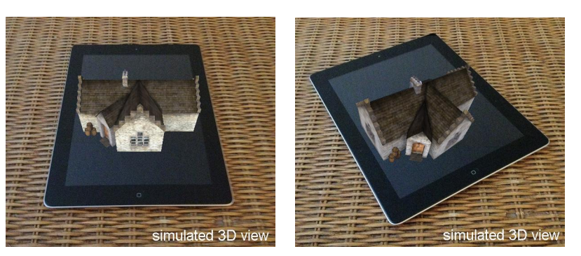
Figure 6: The phantoView system -3D object models loaded into the system are rendered in real-time as phantograms to the tablet's display. A rendered object appears to be sitting on the tablet's surface. Rotating the tablet about the vertical axis allows the object to be seen from other viewpoints.

A pinch gesture scales the object. A two-finger swipe changes the azimuth and elevation of the scene lighting. A singlefinger swipe switches between loaded object models. The phantoView application provides a unique new tool that allows tangible interaction with virtual objects.