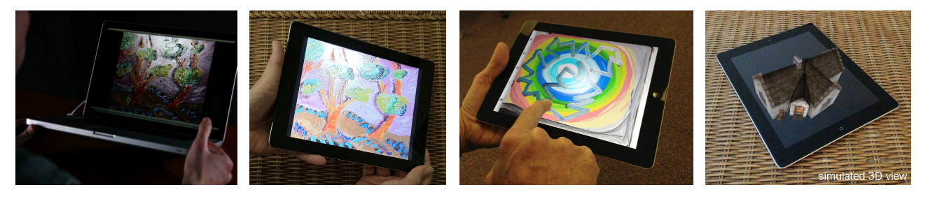
Figure 1: Tangible imaging systems (left to right): The first generation tangiBook system developed using an off-the-shelf laptop computer; the tangiView system implemented on a tablet device; the tangiPaint application that allows the creation of paintings with rich surface properties; the phantoView system that allows tangible interaction with three-dimensional object models.

Keywords: augmented reality, tangible user interfaces, 3D interaction, 3D displays