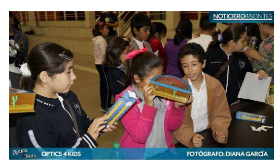
Figure 10. Group of children relating the law of reflection learned with the reflection box with how works the periscope.

At the end of the activity, the students understand different applications of this law as magic tricks, periscopes, change the path of the light and others (Fig. 10). This version of the law of reflection activity keeps the attention and the curiosity of children because they do not know the function of the box.