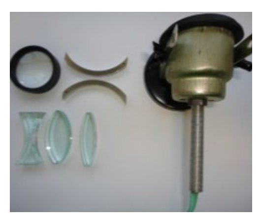
Figure 4. Some of the components of the Optics Kit (Ruiz-Mendoza) using at the begging of the project.

It was necessary make changes in the Kit, at the begging the glass lenses were substituted by acrylic lens designed by graduate Physics students of the UANL. Three red laser modules class I replaced the bulb, with a power lower than 5 mW. At the end, a plastic rotating base was adapted to a wooden base homemade, creating with this a portable rotatable base where different lenses were mounted. This device was called "Disc of Optics" ("Disco de la Óptica" in Spanish) and represents the main tool for teaching Geometric Optics (Fig. 5).