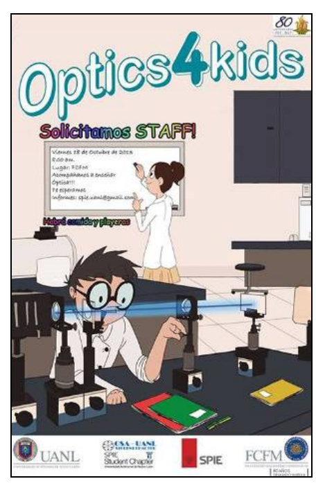
Figure 2. Advertising material used for involve undergraduate students as staff in the 'Optics 4 Kids' events.

This project was granted by the SPIE through the Chapter Activity Grants since 2011 and the Education Outreach Grant in 2013, likewise was supported by the Universidad Autonoma de Nuevo Leon. Making use of the resources provided by the two institutions was possible the purchase of the materials needed to perform active learning activities and the components required for the construction of Optics outreach devices. The activities and devices were designed using, in most of the cases, easy-access materials and were planned to be safe and interesting.