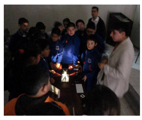
Figure 16. Kids learning about how the human vision works.

This was the most complete activity done during the project; various devices are used: set of acrylic lens, anaglyph glasses and illusions of depth. The aim of this kit is to use different flat lenses to explain how the human eye works, and the visual problems: nearsightedness and farsightedness. At the same time is also used to explain the operation of the concave and convex mirrors, due to that is better if the kids make the activity with the Disc of Optics before and later, with this activity could understand the Geometric Optics applied in the human vision (Fig. 16).