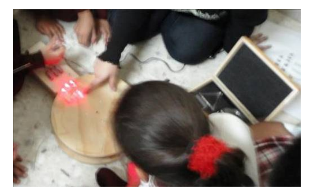
Figure 5. Disc of optics lenses used for teaching Geometric Optics.

It was necessary make changes in the Kit, at the begging the glass lenses were substituted by acrylic lens designed by graduate Physics students of the UANL. Three red laser modules class I replaced the bulb, with a power lower than 5 mW. At the end, a plastic rotating base was adapted to a wooden base homemade, creating with this a portable rotatable base where different lenses were mounted. This device was called "Disc of Optics" ("Disco de la Óptica" in Spanish) and represents the main tool for teaching Geometric Optics (Fig. 5).