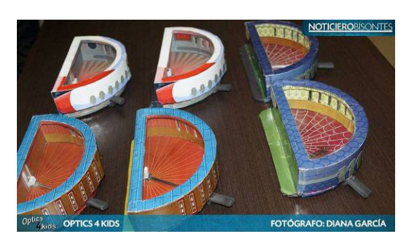
Figure 8. Reflection box create for teach the law of reflection.

Looking for a better activity that promotes the interest of the students and explains the law of reflection a new device was create: "The refection box". It is a box with top and bottom with a half circle shape made with foam board and acetate. It also has a vertical mirror and it is divided in 2 quadrants, the left one has signals from 0 to 80 degrees at intervals of 10 degrees measured from the border with the right quadrant, the right one has the same graduation but in each signal also has a window that allows look inside the box. In left quadrant, a pallet with a standing image, which can be moved and their angles are marked, is placed (Fig. 8).