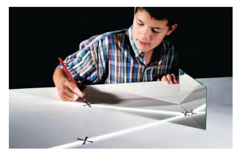
Figure 7. Light reflected into a mirror. Photo by Martyn F. Chillmaid<sup>©</sup> Science Photo Library<sup>13</sup>.

Due to the detection of misconceptions in the understanding of the reflection of light, particularly in mirrors, the needed of an activity that allows the kids observe, analyze and prove the 'law of reflection' was founded; attending to that the 'classic' activity about reflection was implemented: the student uses a mirror where a light ray is pointed and, doing measurements proves the validation of the law; however the activity was not interest for some of the children and, in most of the cases, the kids does not related the measurements with the law of reflection (Fig. 7)