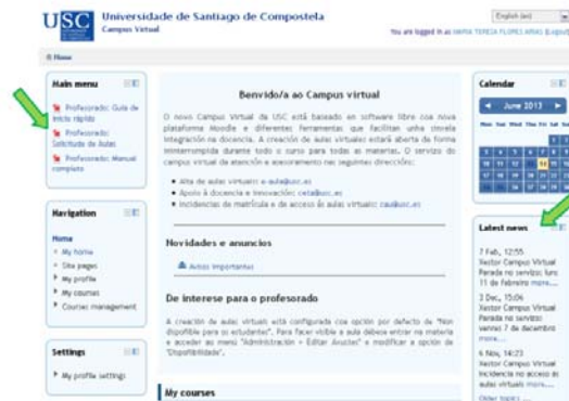
Figure 1: Screen shot of the Moodle platform used in the USC.

In particular, the Physics Degree, placed in the International Campus of Excellence: "Campus Vida", in Santiago de Compostela, has a total of 240 ECTS (according the document of the "Consello Galego de Universidades" of 5 th November 2007), structured according to the following scheme: basic formation (60 ECTS), obligatory (147 ECTS), optional (27 ECTS) and the final project (6). In particular, the subject of Optics is framed in the third year of the degree, as an obligatory course and shared in between two quaters: Optics I at the 1 st quarter with 6 ECTS and Optics II located in the 2 nd quarter, also with 6 ECTS.