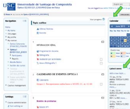
Figure 2. Screen shot of Moodle platform for the Optics I course at the USC.

But the platform is also very useful for networking teachers and pupils. It has a blog that permits the teacher be connected with students by the "latest news". The system send a personal email to the students each time the teacher write a note in this section. Also there is a calendar where teacher can highlight the main date to be remembered: exercise delivery, interesting conferences, oral presentation devoted to special interesting topics, examination date and so on (see figure 2).