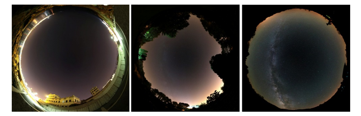
Figure 6. Light pollution and skyglow. The image at the left was taken near the center of a city with one-quarter million inhabitants (A Coruña). The next image was taken from a location eight km away from the city center. The right one was made at a rural area in the Eastern Mountains of Galicia, a place with almost pristine dark skies. They correspond approximately to the same region of the sky. The number of visible stars dramatically decreases as we approach the city center.

The widespread use of artificial lighting has radically altered the nightscape.<sup>5</sup> Poorly designed lighting systems, both public and private, throw substantial amounts of light to the atmosphere in directions and wavelenghts that are neither desired nor used at all for any practical purpose. In recent years sensible concerns have been raised among the scientific community about the problems caused by light pollution, the detrimental effects of the alteration of the natural levels of darkness due to the emissions of artificial light (Figure 6). Light pollution manifests itself in different forms, e.g., as increased levels of skyglow due to atmospheric scattering (Rayleight and Mie), light trespass and glare. Artificial light at night has been shown to have unwanted side-effects on ecosystems and public health, along with the immediate consequences related to energy waste and greenhouse gas emissions.<sup>7-15</sup> Studying light pollution and raising awareness about its effects are activities involving professional researchers of different scientific fields and amateur astronomers worlwide.<sup>25</sup>