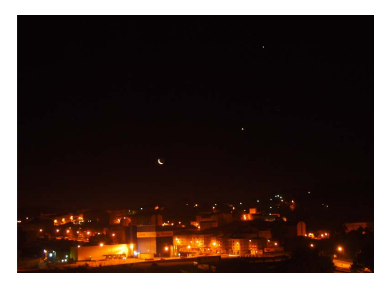
Figure 1: The waning crescent Moon, Venus and Jupiter shining above the city lights .

The terrestrial nightscape is full of sources of relatively small angular size and particular spectral features (Figure 1). The widespread extension of artificial lighting led to a profound change in the visual properties of the night.<sup>5</sup> Streetlights and other artificial sources contribute with a variety of spectra ranging from the blackbody ones associated to incandescent lamps (conventional and halogenous) to the line spectra characteristic of gas discharge lamps (mainly high-pressure sodium vapor) and the more complex ones of fluorescent lamps and white-light solid state sources like phosphor-coated blue LEDs. Spreadsheets with the detailed spectra of the most common types of lamps are available at the NOAA's Earth Observation Group website.<sup>6</sup>