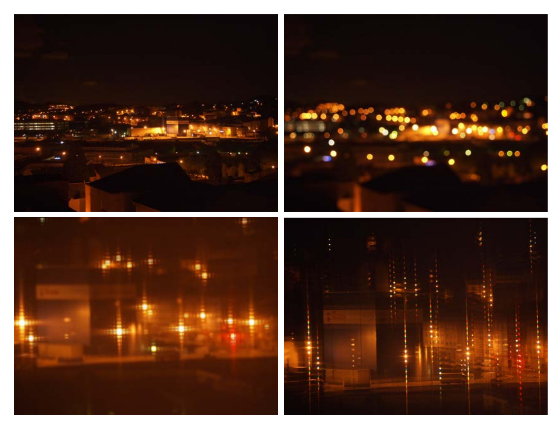
Figure 5. Top left: An urban nightscape; Top right: The same nightscape as seen by a myopic eye; Bottom left: Diffraction effects looking naked eye at the nightscape though a window curtain: Bottom right: Idem, through a low frequency diffraction grating: note the almost monochromatic emission of the LED sources used in the traffic lights, unlike the more complex spectra of the high-pressure sodium vapor lamps.

- Interference and diffraction: Streetlights are suitable sources to observe interference and diffraction phenomena, using the eyes as the only detector. High-pressure sodium vapor lamps have intense emissions in several interesting wavelenghts; the LED sources used in traffic lights emit instead quasi-monochromatic light. Interference and diffraction effects can be observed by stopping the eye pupil using cards with appropriate holes or slits. Many students are surprised to see that observing Young fringes or Airy patterns does not require an optical bench. A wealth of diffraction patterns of different sizes can be obtained by carefully stopping the eye pupil by means of the eyelids, and additional patterns appear if the eyelashes superimpose over the pupil aperture. Textile fabrics produce interesting naked-eye diffraction effects (Figure 5).