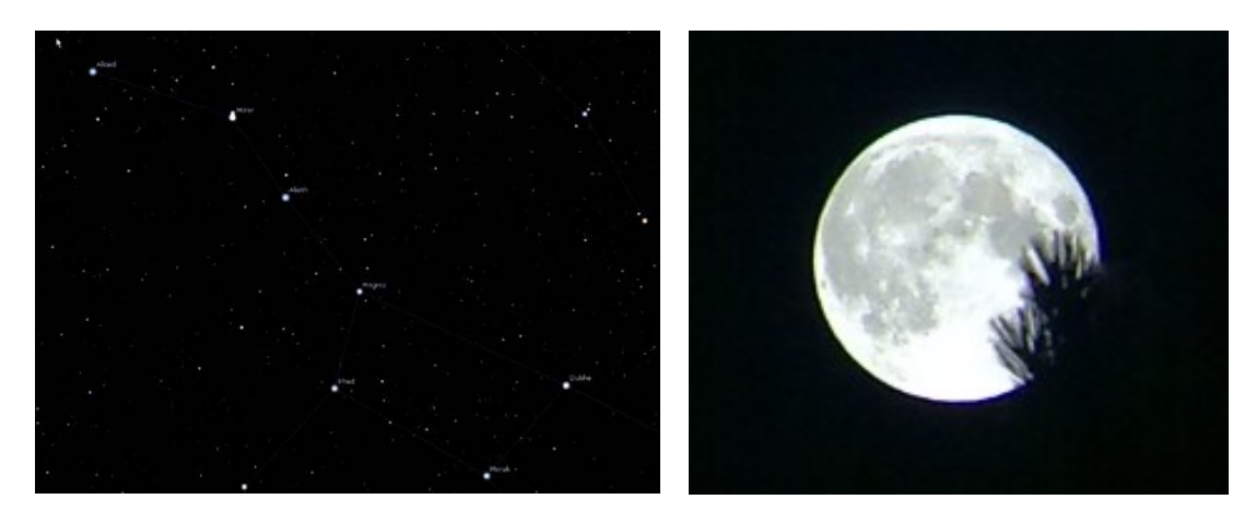
Figure 4. Visual acuity tests. Left: the Big Dipper asterism in Ursa Major constellation. Mizar is the second star from the left in the handle of the dipper (image drawn using Stellarium). Right: Discernible features in the rising Full Moon.

- Detecting peripheral events: The night sky offers also a wide range of possibilities to check the ability of the eye for detecting light flashes or moving objects in the peripheral regions of the visual field (poor man's campimetry). Classical targets are "shooting stars" or meteors, the traces left at the atmosphere by the thermal and mechanical disintegration of small particles of cometary and asteroidal dust. Any typical night one can observe several meteors brighter thant the third magnitude and, from time to time, much brighter events due to bigger-sized stones (bolids). The number of meteors is higher at some days of the year, when the Earth crosses regions close to the orbits of their parent bodies. This gives rise to "meteor showers" whose calendar and characteristics can be found in the International Meteor Organization (IMO) website.<sup>23</sup> Even duuring a meteor shower shooting stars are intrinsically random events, whose individual locations and times of occurence cannot be predicted. If predictable events are required, one may resort to Iridium flares and the transits of artificial satellites of different brightnesses, especially the International Space Station, whose details can be known in advance.<sup>4</sup>