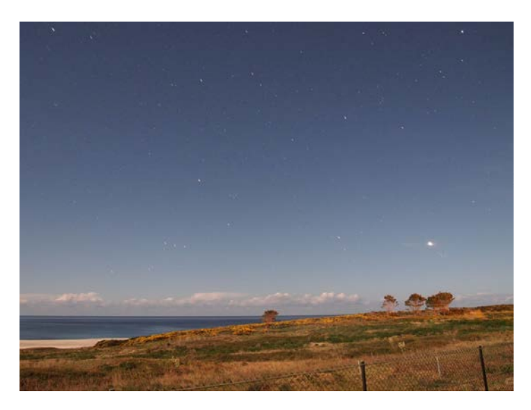
Figure 2: The colors of the night. A full-color midnight landscape photographed using the light of the full Moon.

- Colors: what our eyes miss at night. Moonlit nightscapes are full of colors although our eyes are unable to perceive them because the ambient illumination levels are insufficient for the cones to work properly. However they are there, even in moonless nights only lit by starlight. An easy demonstration can be achieved using a small compact camera to photograph the nightscape under the light of the full Moon, with an exposure of several tens of seconds: the landscape features show the full colors we are used to see during daytime. The fact that this is actually a night shot is only suggested by the presence of stars in the sky (Figure 2).