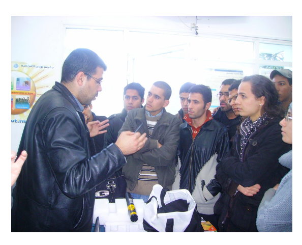
Booth set at the entrance of Sup'Com to explain the role of the Tunisian student chapter.