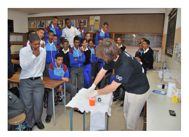
Road trip: 2011 West Coast.