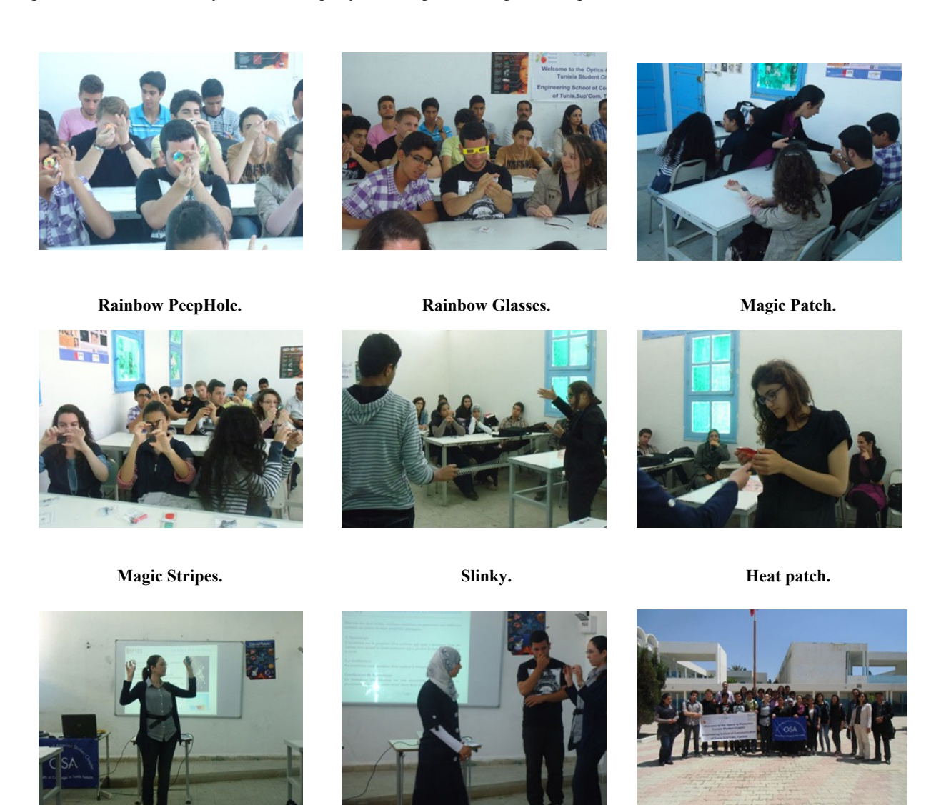
Figure 2. Education outreach activities of the Tunisian student chapter.

Another activity was launched through the involvement in the organization of the Summer School "GET AHEAD WITH OPTICS" which was held in Tunis in September 2012. The Tunisian student chapter participates in the organization of the summer school and preparing the best poster student award during the poster session. The interdisciplinary program is targeted towards female graduate students from Tunisia and Germany, which are interested in the field of optics, photonics, or measurement techniques. Its content and structure are designed to provide them with professional skills and help them succeed in the dynamic and rapidly evolving field of optics and photonics.