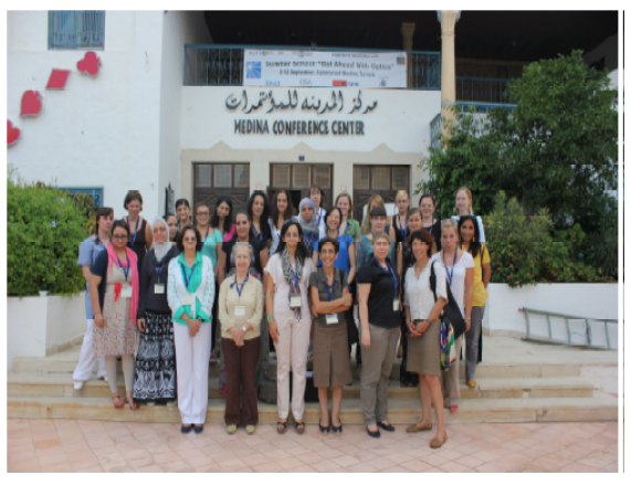
Group Photo during the" Get ahead with optics" school.