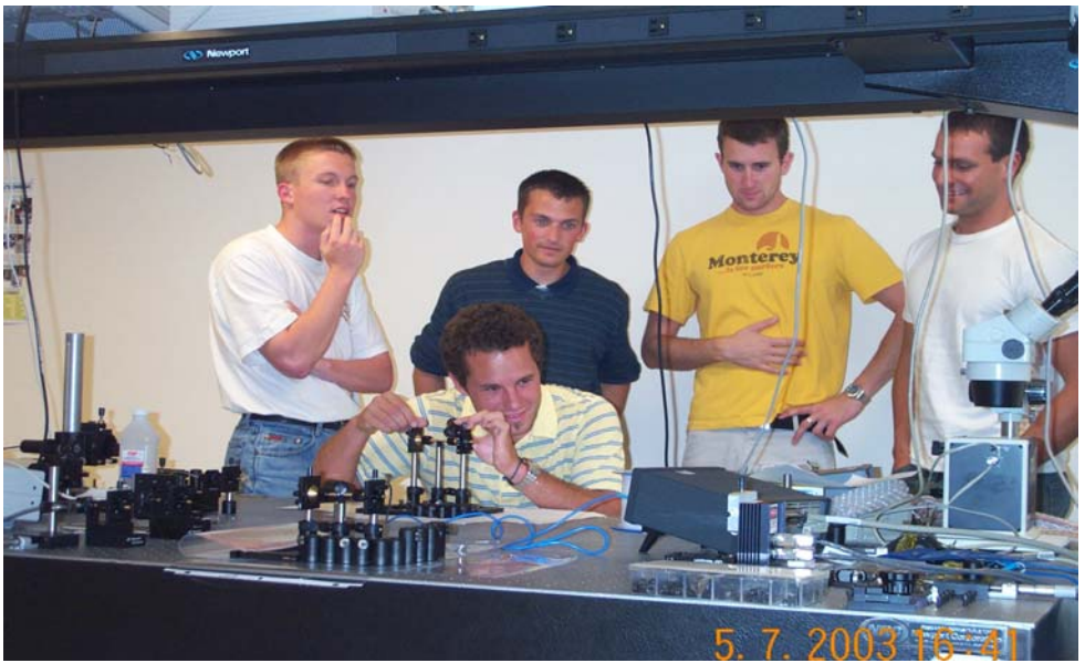
Fig. 2. Students experimenting with the optical communication link (Lab 7).

own in 1.5 hours. Having the link set up so that students see it working and then take some measurements allows them to focus on understanding rather than getting too frustrated by the alignments. The USD students were impressed with the French students' skill at using PowerPoint to animate graphics in their description of the multiplexer and felt it enhanced their own understanding of the technical content. After their own attempts to align light to fibers, they were especially impressed with the French students' experimental skill in assembling a complicated setup.