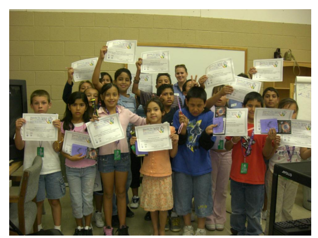
Figure 3. Students from the South Tucson Boys and Girls Club receive their Hands-on Optics "Masters of Reflection" certificates.

Another remark from a Boys and Girls staff member was "One new young man who is 11 wasn't really sure he wanted to come to the class, and I told him to try it because I thought he'd like it. Part way through he came over to me and said "this is really cool - I didn't know you could do all this stuff with lasers". These "aha" moments for the kids are the reason it is so important to keep providing them these opportunities you truly are making a difference in the life of these young people by giving them this exposure to science."