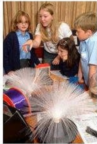
Figure 2: Photographs from various sessions showing a) periscope making and b) optical fibre lamp demonstrations.