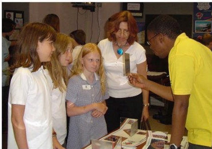
Figure 3: Parent, children, and postgraduate volunteer carrying out some reflection experiments with mirrors