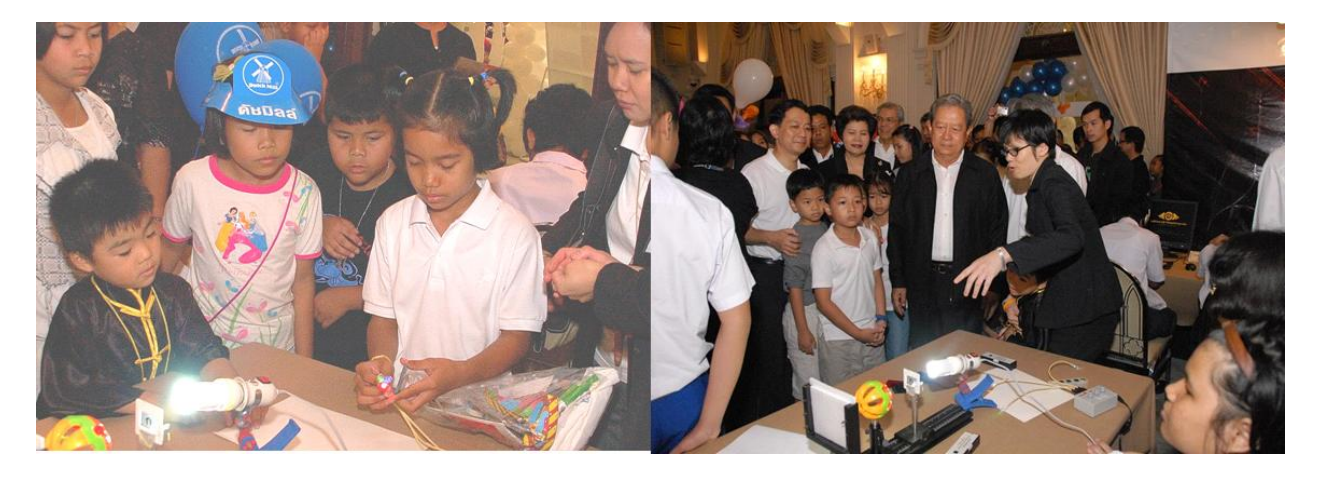
Figure 6. Our activities shown during the National Children's Day at Royal Thai Government.

Based on our activities delivered to students, teachers, and general publics, they now realize and understand more about the impact of OP for our country's sustainability and competency. However, there is a barrier that delays steps to improve S&T education system in Thailand. Especially, we find that policy makers in the education are not seriously taking into consideration the OP. To alleviate this problem, we steer to general publics and local media. If they realize the importance of S&T, in particular to OP, they will help us to promote OP to our society. #With this approach in mind, we join two national social festivals such as the National Children's Day and the National Science Day#o demonstrate OP (see Figure 6). A correspondent from Manager Newspaper , one of the local newspapers, comes to interview us about our activities and goals.