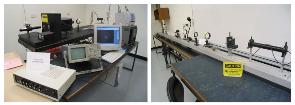
Fig. 1 Experimental setup for the Fabry Perot (left) and optical data processing (right) experiments in the undergraduate optical physics laboratory, Department of Physics, Macquarie University.

Third year students of Optical Physics undertake experiments selected from Optical Data Processing (Diffraction and Image Formation); Fourier Transform Spectroscopy; Fabry Perot Interferometry; Polarisation & Berry Phase; Holography; Correlation Interferometry & Spatial Coherence; Single Photon Counting and Interferometry; and Photonics Simulation Software for Teaching [1]. Pictures of some of the bench layouts for these experiments are shown in figures 1 and 2. Students write major reports on two of the experiments they complete, following the guideline for report writing developed as a consensus document within the department [2]. These reports and the lab book record of four completed experiments are major assessments that are included in a learning portfolio for the unit which the students have to complete.