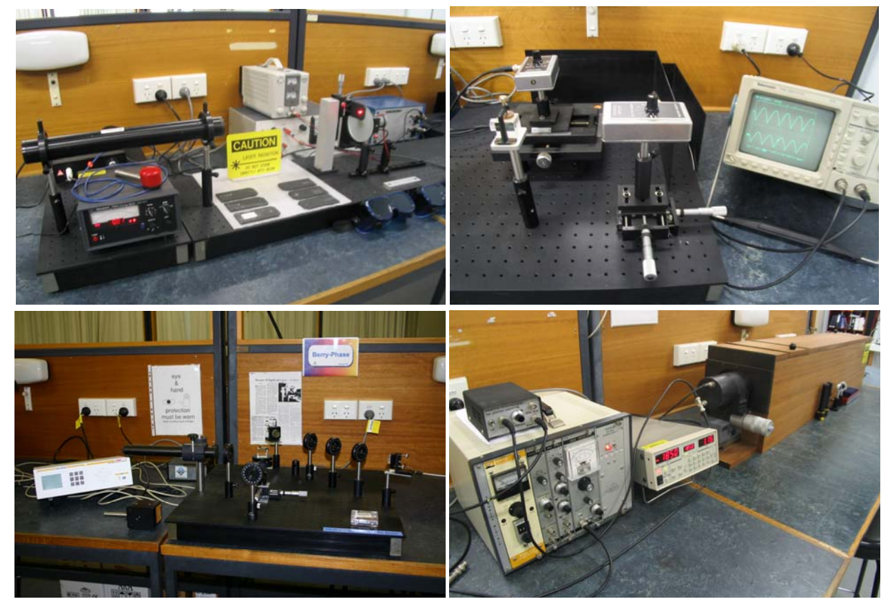
Fig. 2 Experimental setups for the Correlation interferometry (top), Polarisation and Berry phase (bottom left), and photon counting and interferometry (bottom right) experiments in the undergraduate optical physics laboratory, Department of Physics, Macquarie University.