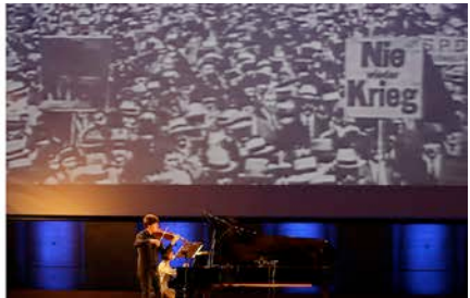
Fig. 2: Violonist Joshua Bell interpreting "Einstein's Light" by Bruce Adolphe