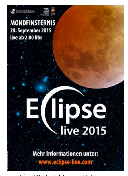
Fig. 10: Total Lunar Eclipse

We invite everyone to take part in the live broadcast of the total lunar eclipse on September 28. For more information, go to: www.eclipse-live.com.