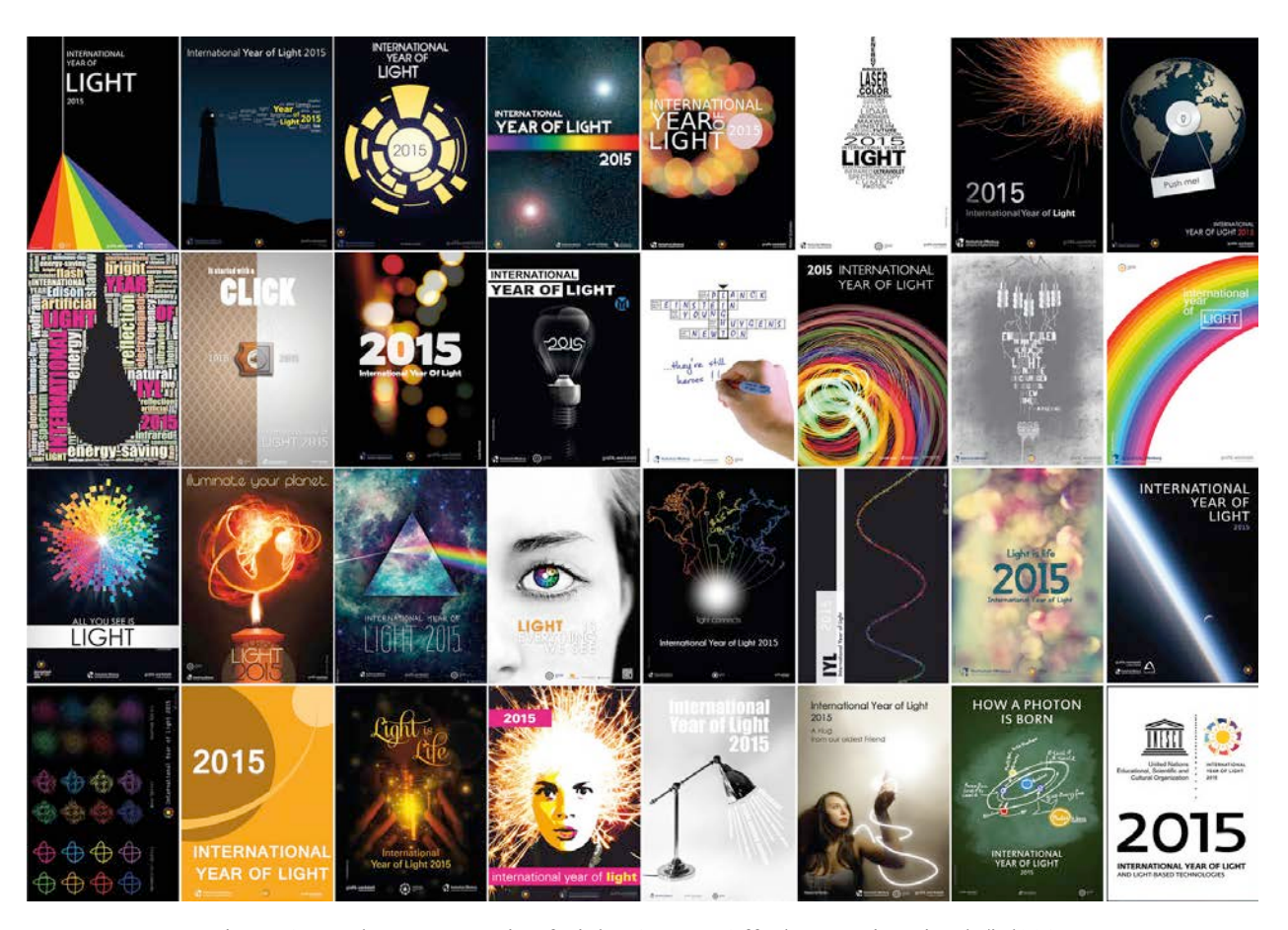
Fig. 5: Artwork poster: Magic of Light; © www.Offenburg-University.de/iyl2015

As described in earlier papers [6], we managed to prepare a whole poster series in the framework of the IYL2015. It should be emphasized that this was an interdisciplinary project open to anyone, i.e. not just students of physics. Figure 5 shows a selection of the best works, combined on a postcard which was used for promotional purposes in the run-up to the IYL2015.