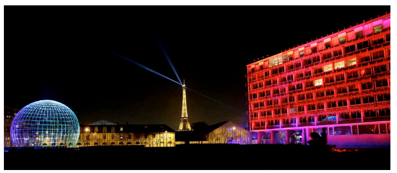
Fig. 4: "Light is Here," an impressive light projection onto the UNESCO building by Finnish video artists

During the opening ceremony, Offenburg University students presented an interactive projection in the UNESCO Foyer. Several other projects ensued at the University from the exciting prospect of the IYL2015, including: