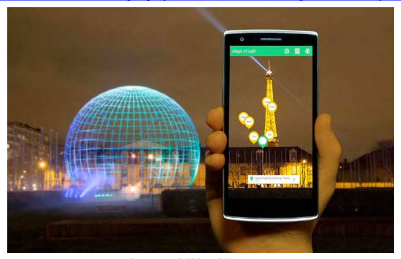
Fig. 6: Invisible Light App

http://www.wikitude.com/showcase/invisible-light-project-wikitude-hs-offenburg-international-year-light-2015/.