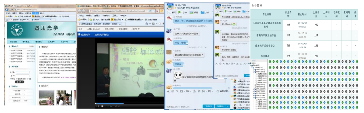
Figure 2 The web side, course, off line question chat, homework checklist of AO course

Current, the National Optical education SPOC system has entering second step, there are more than 20 universities to join the program. And we choose two courses to act as the SPOC courses. With enough student participant samples, we can find out the education result of our special SPOC system with the traditional local classroom local teacher teaching system.