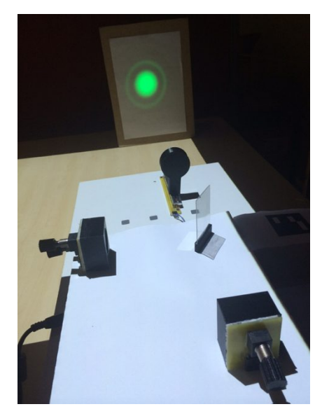
Figure 3. Photograph of the AMI setup, where the interference pattern (here rings) is projected in a surface.

Equation 1. Interference pattern equation used for monochromatic light.