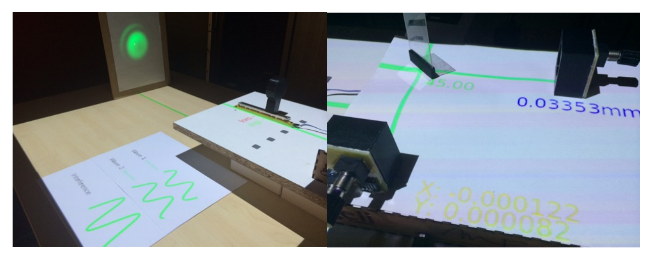
Figure 4. Workspace with augmented information using a video projector.