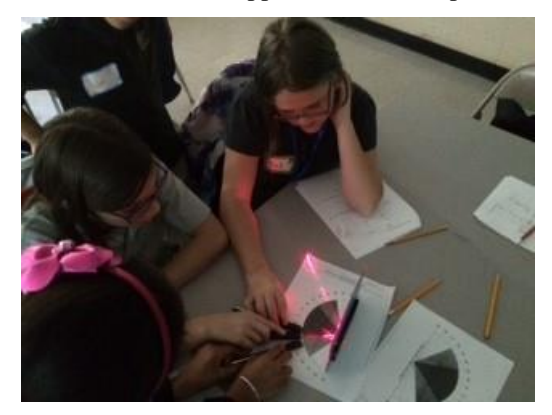
Figure 3. Students use a laser pointer, mirror and protractor to discover the law of reflection

Students were given small rectangular plastic mirrors that could stand vertically (they were taped to small blocks), a laser pointer and printed paper protractor. After reviewing the use of a protractor to measure angles, students recorded the reflected angle for various incident angles and determined that the reflected angle is equal to the incident angle. They were not explicitly told the law of reflection, but discovered it for themselves. (See Figure 3.) An animated PowerPoint presentation was used to show how the law of reflection applies to smooth (specular) and rough (diffuse) surfaces.