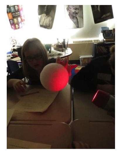
Figure 2. Students perform the "reflection test" with a red flashlight and a Styrofoam ball.

The final activity was to test whether light is reflected from a variety of common materials: flat pasta, pieces of foam, fabric, paper, plastic, aluminum foil and more. Students first sorted the items into three categories: shiny, rough and dull, and then tested each object using the flashlight method. In some cases students needed to figure out how to fairly test some of the smaller objects, for example, a pipe cleaner could be bent into a flat shape so that reflected sufficient light to see on the table. After expressing surprise that all of the items in the collection reflected light to some degree, students spontaneously tried to determine if other items- such as their own hands or arms- were similarly reflecting.