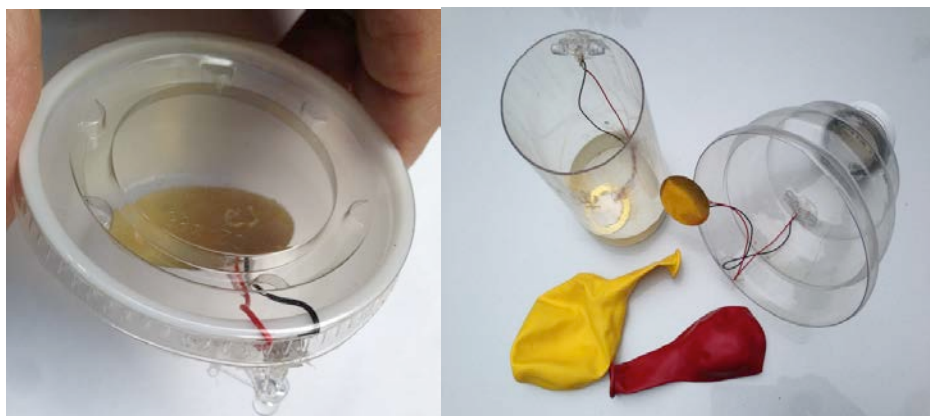
Fig. 6. (L) Shake flashlight made from a recycled condiment cup. (R) Plastic bottles cut to make drum. Here that are shown with balloons as the membrane.

desired final position, use the clear packing tape to hold them in place and give the entire container a good wrap of tape to seal the completed unit. Shaking causes the piezo element to strike the container walls and illuminate the LEDs.