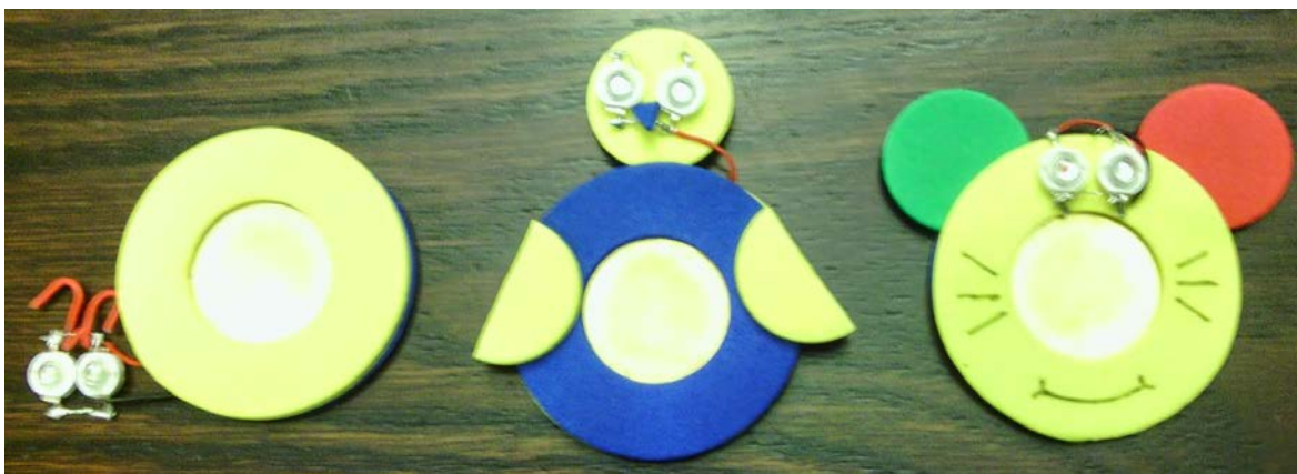
Fig. 7. Prototype piezoelectric animals. From left to right: Snell the Snail, Oscar the Owl, and Maxwell the Mouse.