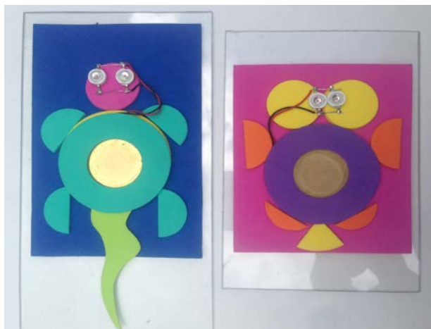
Fig. 1. Examples of art created by participants. The LED “eyes” can flash, alternate or wink, depending on the touch.