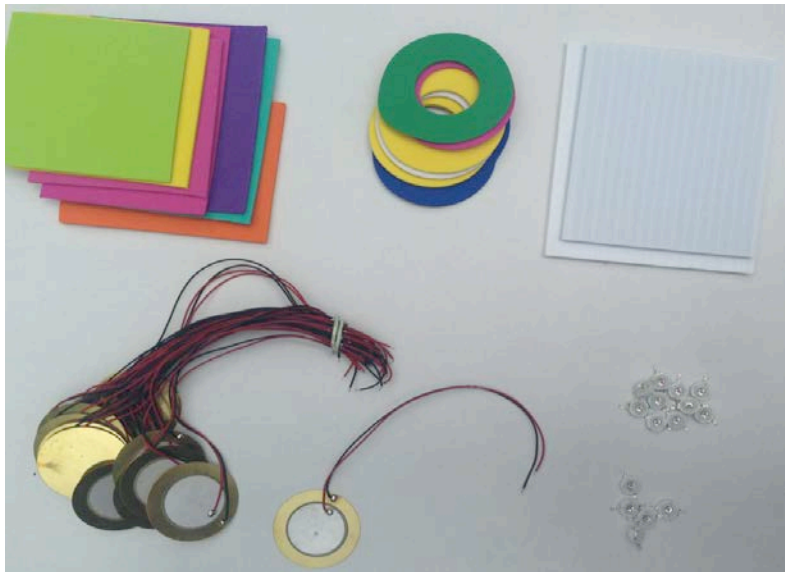
Fig. 3. Materials (row 1 – craft foam squares, craft foam rings, corrugated board and row 2 – piezoelectric guitar pickups, LEDs) used to create artful animals

Besides the piezoelectric element, most materials for this project are available from local sources. An overview of the materials is shown below in Fig. 3.