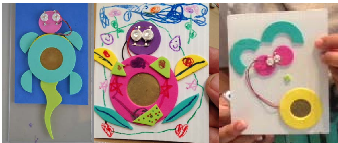
Fig. 8. Participant animals. From left to right: Turtle, creature, and mouse