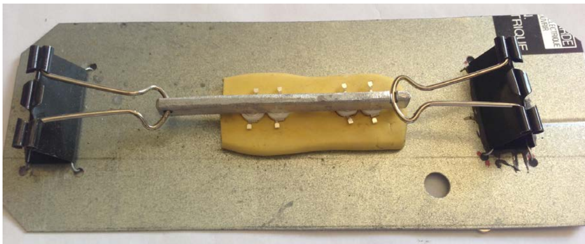
Fig. 5. Soldering rig for easy soldering of the piezoelectric element leads. The paper clamps and bar hold down the LEDs. The yellow in the center is ordinary craft silicone that has cured.

Older participants are instructed on soldering to make electrical connections, and warned of the hazards of soldering (hot metal, solder fumes, etc.) followed by a demonstration. They select two LEDs of whichever color and are shown how to strip off ½ inch of insulation from the two wires on the piezo disk. We created a silicone rubber jig for soldering shown below in Figure 5. The yellow is ordinary craft silicone that has cured. The LEDs should be tested before complete soldering. If you cannot determine LED polarity by the markings, then solder on one LED to the two wire leads and test operation by gently tapping on the disk. You should see a brief flash and note that flashing seems to stop working with several of rapid taps. Connect the second LED; if you note a brief flash or both LEDs appear lit with rapid tapping, the polarity is correct. If not, reverse the LED. Properly connected the LEDs will appear to flash alternatively.