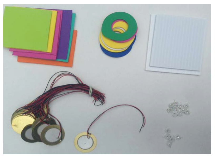
Fig. 3. Materials (row 1 - craft foam squares, craft foam rings, corrugated board and row 2 - piezoelectric guitar pickups, LEDs) used to create artful animals

Besides the piezoelectric element, most materials for this project are available from local sources. An overview of the materials is shown below in Fig. 3.