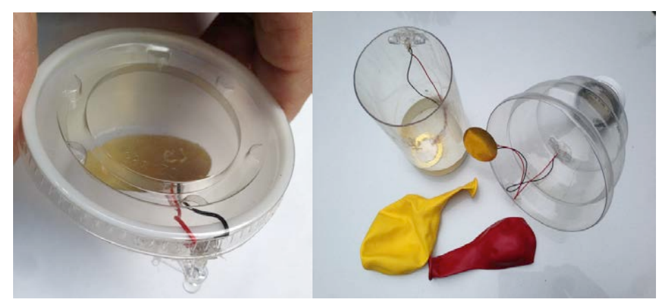
Fig. 6. (L) Shake flashlight made from a recycled condiment cup. (R) Plastic bottles cut to make drum. Here that are shown with balloons as the membrane.

desired final position, use the clear packing tape to hold them in place and give the entire container a good wrap of tape to seal the completed unit. Shaking causes the piezo element to strike the container walls and illuminate the LEDs.