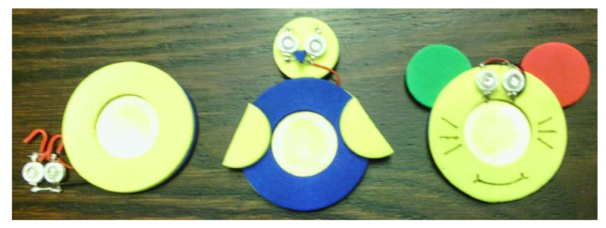
Fig. 7. Prototype piezoelectric animals. From left to right: Snell the Snail, Oscar the Owl, and Maxwell the Mouse.