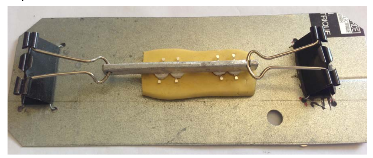
Fig. 5. Soldering rig for easy soldering of the piezoelectric element leads. The paper clamps and bar hold down the LEDs. The yellow in the center is ordinary craft silicone that has cured.

Older participants are instructed on soldering to make electrical connections, and warned of the hazards of soldering (hot metal, solder fumes, etc.) followed by a demonstration. They select two LEDs of whichever color and are shown how to strip off ½ inch of insulation from the two wires on the piezo disk. We created a silicone rubber jig to hold the LEDs for soldering shown below in Figure 5. The yellow is ordinary craft silicone that has cured. The LEDs should be testing before complete soldering. If you cannot determine LED polarity by the markings, then solder on one LED to the two wire leads and test operation by gently tapping on the disk. You should see a brief flash and note that flashing seems to stop working with several of rapid taps. Connect the second LED; if you note a brief flash or both LEDs appear lit with rapid tapping, the polarity is correct. If not, reverse the LED. Properly connected the LEDs will appear to flash alternatively.