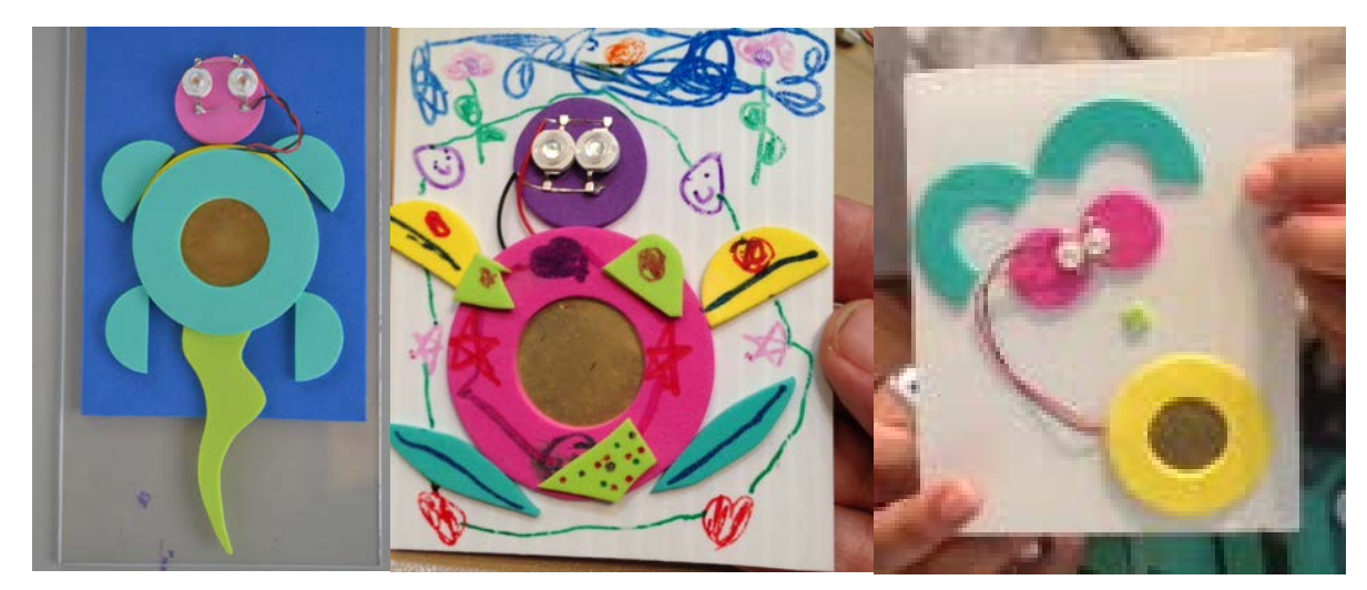
Fig. 8. Participant animals. From left to right: Turtle, creature, and mouse