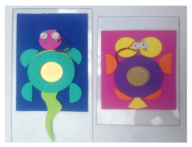
Fig. 1. Examples of art created by participants. The LED "eyes" can flash, alternate or wink, depending on the touch.