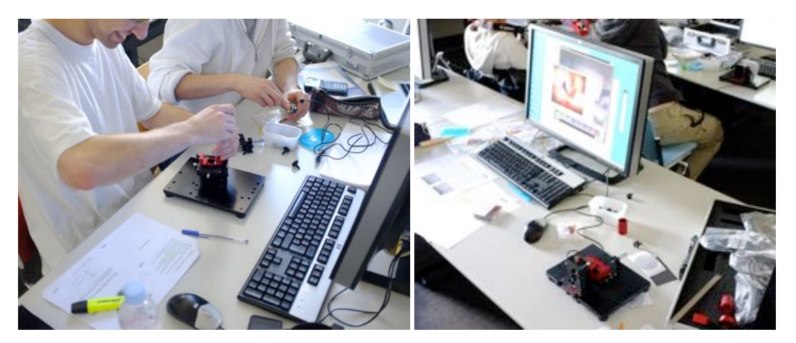
Figure 1. Students at a session mounting and evaluating their experience. (Example: Pinhole camera)

The course is designed for students without particular pre-knowledge and develops competences for system integration starting from design of optical systems to data evaluation. Students gather practical experience on subjects in optical micro-engineering that is not accessible elsewhere and difficult to teach without "hands-on".