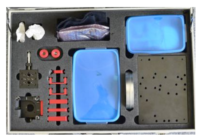
Figure 2. Toolbox developed especially for the lecture. It does not need special equipment expect a PC for running evaluations and experiment. All active components are UBS powered.

Figure 2 shows the content of the optical toolbox. It contains a breadboard and specialized optical components such as lenses, alignment stages etc. In Fig. 3 we show some of the setups that can be mounted with material.