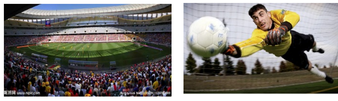
Figure 1. ball game watching

The core value of this teaching theory is "classroom atmosphere". First of all, let us take soccer as an example, why do people want to watch on the pitch? In the huge tens of thousands of people can accommodate the stadium, the audience can not see the distant players without comfortable seats, but people still flocking willing spend a little extra cost to the court to watch the ball. The answer is very obvious, the atmosphere! In the atmosphere of the ball game, the audience was attracted by the game, cheering for a good play, disappointed for a mistake. We will be compared to the classroom with the conduct of the game in this paper. the classroom atmosphere creates a serious impact on teaching quality, and a good atmosphere to drive learning. For example, there is a couple, and the wife is not interested in the ball game. When the husband watching the game at home, no matter how interesting the performance, it is difficult to attract his wife. However, once his wife was pulled to the stadium to watch the game, in the atmosphere, often makes the wife passionate up, and take the initiative to ask some of the rules of the game. From the point of view of learning, this leads to the active learning and it is the most effective learning methods. It is highlighting the importance of the atmosphere affecting the effectiveness of learning.