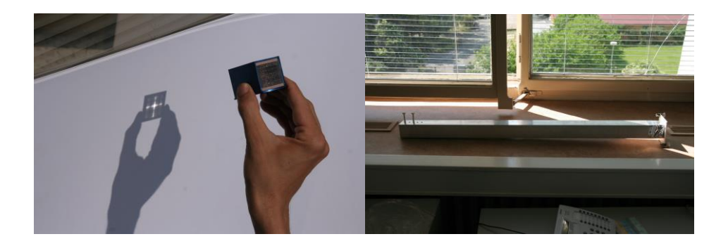
Fig. 2 Imaging properties of the Mini 2D LE system – imaging of the Sun in optical light and The Mini 2D LE module with focal length of 900 mm (right).

1D Lobster Eye module with focal length 250 mm is omposed of 182 wedges and 90 reflective double-sided goldplated foils (thickness 150 \mu m. Input aperture: 29 × 19 mm, Active part of the foils: 19 mm in width and 60 mm in length, Outer dimensions: 29 × 31 × 60 mm, Energy range 3 to 20 keV.