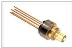
Fig. 2 VCSEL with LC encapsulate

Both VCSEL and Photodiode use encapsulate compatible with LC standard type in order to allow better and easy junction to the ferrule and optic fibre.