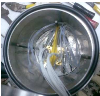
Fig. 5 Receptacle for Gamma radiation test

Both SIOS, with and without package, surpassed the TID at high flux without any degradation in their performance or BER value.