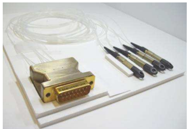
Fig. 1 SIOS

These advantages have raised the interest of the European Space Agency (ESA) and many system integrators for future satellite harnessing. The space community has identified fibre optics as a desired solution, for payload and potentially for platform applications and for the high bit-rate links a new standard, "SpaceFibre", extension of the "SpaceWire", is being developed making exclusive use of fibre optics. Similarly the use of optical fibre for the current standards such as Spacewire, CAN, 1553 or other links (TM/TC-Calibration, clock signals).