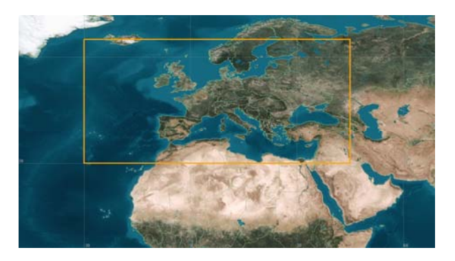
Fig. 1 GEO-UVN instrument coverage requirements: the yellow rectangle is the required coverage over Europe.

According to current ESA-EUMETSAT Working Assumptions on GMES and following recommendations expressed by the GMES Atmospheric Service Implementation Group (GAS) in March 2008 [4], the GEO-UVN instrument will mainly cover Europe (latitudes 30° N/ 65° N and longitudes 30°W/ 45°E at 40°N latitude) from a GEO-stationary orbit at 0° longitude (MTG-S satellite). This corresponds to a solid angle of 8.8 ° E-W x 3.4° N-S. Fig. 1 shows the Field of View of the GEO-UVN instrument.