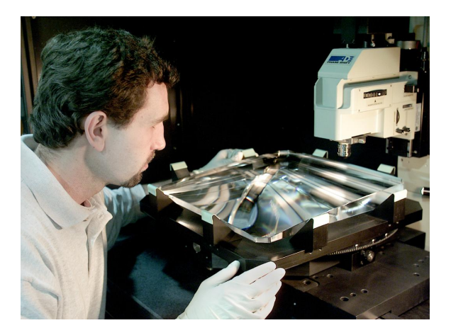
Fig. 3 One of three 168 inch diameter ring polishing used to deterministically final figure NIF laser glass and BK7 optics (left image). Wedged off-axis aspheric final focus lens under inspection for PSD and microroughness (left image).