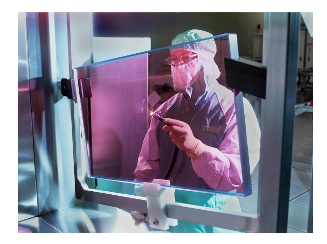
Fig. 1 Continuous strip of laser glass exiting the melter (left image) and completed laser glass slab undergoing inspection after cleaning (right image).