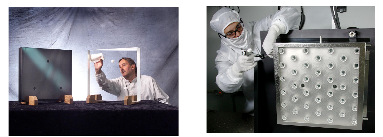
Fig. 4 Example of an unsolarized and solarized transport mirror (left image). NIF deformable mirror undergoing wavefront validation testing (right image).

The production mirror has thirty-nine actuator posts and two alignment ports that are CNC machined out of a monolithic piece of BK7. A metal reaction block supports the actuators rigidly to 39 separate machined flexures. The reaction block and glass mirrors are epoxied together under an interferometer to monitor the DFM wavefront during bonding and curing to validate compliance with specification after curing. Finally mirrors are characterized after bonding as illustrated in figure 4.