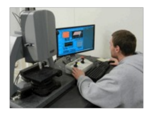
Figure 8 – Student working with Zygo MetroPro software and white light profilometer.

final report, "While our project was not completed to the degree we were hoping, we were extremely successful in developing a wealth of knowledge... as well as be(ing) trained in many aspects of polishing and roughness testing."