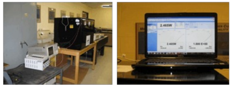
Figure 4 - (Left) Unit under test. (Right) Ophir StarLab software interfaced with LabView for measuring laser

During the 2011-2012 academic year, Nufern sponsored another capstone project involving the design and construction of an automated fiber laser final test unit. The fiber laser test unit was designed using a commercial thick gauge steel tool box to ensure laser safety, and modified to accommodate test equipment, wiring, and interlock hardware. The test unit is capable of measuring laser output power and wavelength automatically and logging using data using LabView in the final test stage of Nufern's fiber laser manufacturing line. This specialized training and technical support has resulted in LEOT graduates with the real-world knowledge and skills desperately needed by Nufern and other companies – skills that would be difficult or impossible to teach in the classroom.