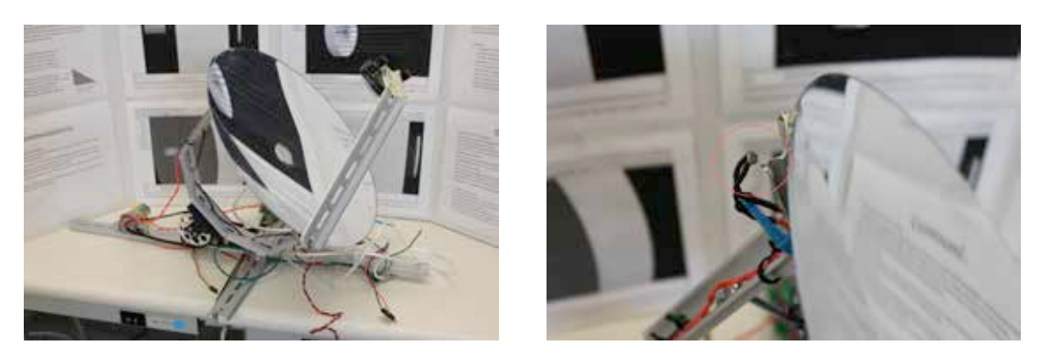
Figure 6 – Revised version of the solar tracker/collector using a lightweight Cassegrain mirror system. Left: Mirror assembly with motor to the left. Right: Light sensors are mounted below the rim of the mirror on opposite sides.

Committee meeting. Nonetheless, discovering what appears to be a similar design in a newspaper article on fiber lighting of a proposed underground New York City park was an exciting clue that the student was on the right track.<sup>3</sup>