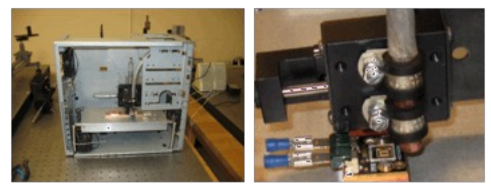
Figure 1 - (Left) Prototype LED enclosure. (Right) High powered LED mounted for x-y positioning.

RSL Fiber Systems of East Hartford, CT is known for developing sophisticated remote lighting systems on a large scale for naval ships as well as commercial remote lighting applications. To help expand their business into the consumer market, the results of this project will help RSLF demonstrate the application of their technology in Volvo Trucks in Brazil, which would like to integrate such a lighting system into their Concept Truck due for 2013.