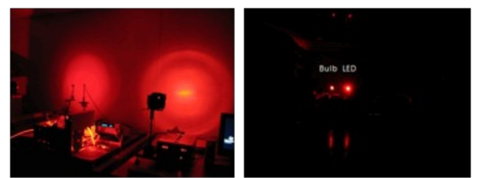
Figure 2 - (Left) Light output for bulb (left) versus LED (right). (Right) Visibility of bulb (left) versus LED (right) at 30 ft.

capable of providing sufficient light output needed to overcome fiber optic coupling losses, experimenting with different types of optical fiber (i.e., solid core versus fiber bundles; glass versus plastic, etc.) to determine the most cost effective delivery method, and measuring the luminous output of the system to ensure that is comparable to traditional incandescent bulb tail lights. After several months of research, evaluation and prototype testing, the student was able to successfully demonstrate a viable fiber optic tail light system to RSL Fiber Systems and Volvo Trucks in a final poster board presentation at the LEOT program's industrial annual advisory board meeting.