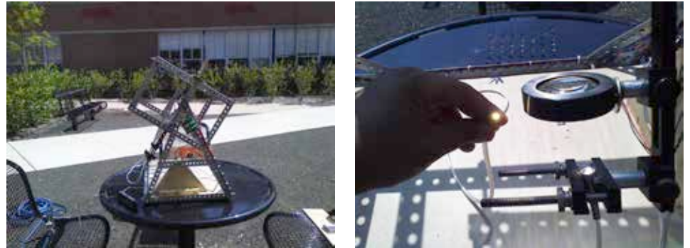
Figure 5 - (left) the completed solar tracker/collector. (right) close-up of lens, fiber collimator and output from the end of the fiber. Not visible is an IR filter located above the lens.

Once the major pieces were ordered and assembly had begun, the students realized they did not have the specifications for the fiber that was to receive the light. The RSLF engineer suggested they contact OFS in Avon, CT for samples of suitable fiber. In retrospect it would have been better for students to have a fiber "target" to design for right from the beginning; nonetheless their final design transmitted sufficient light that they were deemed winners of the competition. (It helped that the other college team did not complete the project.) The prize was a $2000 award to the LFOT program, a "small fortune" that was used to purchase hand tools for the senior project lab and provide supplies for two more years of senior projects.