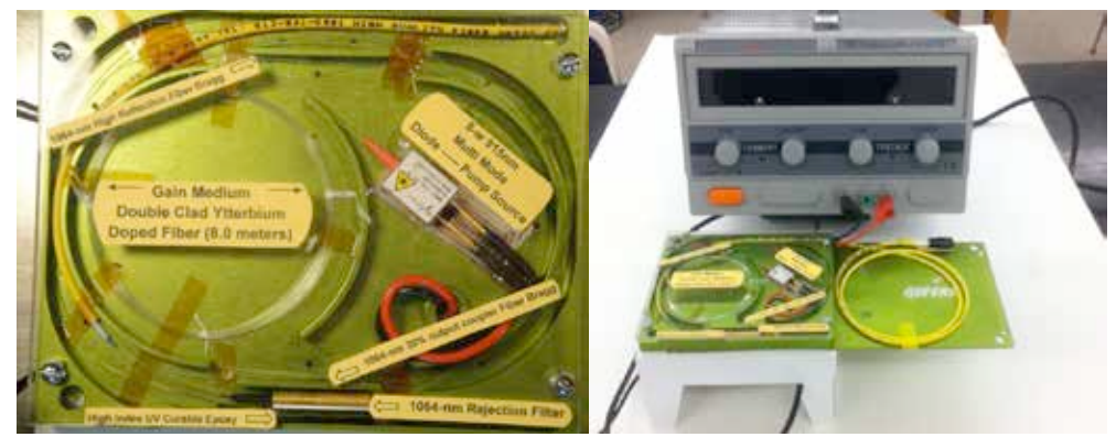
Figure 3 -(Right) Fiber laser gain medium and pump lasers (Left) Ytterbium-doped fiber laser demonstration unit.

Over two years (2010-2011 and 2011-2012 academic years) several teams of STCC LEOT students worked with engineers and scientists at Nufern to develop working fiber laser demonstration units with the potential for being marketed as a "fiber laser education kit." Nufern provided all of the discrete components required to construct the laser including pump lasers, active fiber, Bragg gratings, couplers, housing and power supply. Over the two-semester senior project course sequence, students visited Nufern's plant on a bi-weekly basis to receive mentoring from engineers and scientists, and were provided specialized on-the-job training in component handling, fiber winding and splicing, and specific testing procedures used by Nufern in the manufacturing of their lasers. The completed and functional laser is shown in Figure 3.