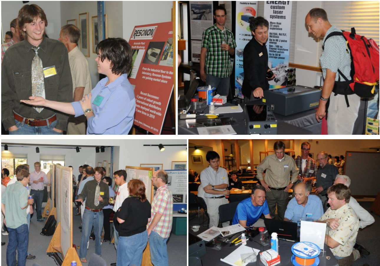
Figure 2. Photographs of various groups of students, faculty, and business leaders during some of the annual Optical Technology Center conferences held at Montana State University.

MSU optics faculty remain in traditional departments, but the Optical Technology Center serves as an umbrella-like organization, bringing together students and faculty doing optics-related research and promoting optics education, research, and technology transfer into local industry. In 2013, the Montana Photonics Industry Alliance 6 (MPIA) was created for the larger purpose of promoting policies to support the photonics industry and for helping to recruit