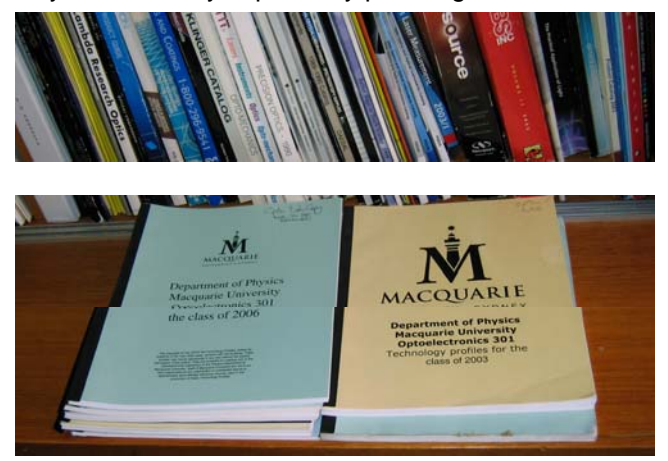
Fig. 1 Optoelectronics technology profile volumes as distributed to each student in the class. Profiles are copyright of the individual students and permission must be sought from the student for profiles to be distributed outside the class.

Student motivation is also addressed by "publishing" an annual volume of the technology profiles from the class as a whole and this has been a successful motivator for most students. Students are encouraged to produce an example of their work that they can show to potential employers. This student publishing was one of the features of teaching practice in the department that was selected for inclusion in the resource booklet from the project "learning outcomes and curriculum development in physics" produced as a national resource for tertiary physics teaching and learning in Australia<sup>1</sup>. Plagiarism is still an issue for a small number of students and some technology profiles are not "published" for this and other reasons. The importance of the dialogue between the "teacher" and each student as an individual, around the task, emerges as a key driver of deeper learning. Motivating students to complete the planning stages of the task in good time, so they may avoid making poor decisions on topic, and reference resource selection, with inadequate time to complete the task to the best of their abilities, remains a challenge. Student engagement, and therefore benefits, remains variable across the student population. A major benefit of the explicit and detailed nature of the task design is that it facilitates the teacher to have an evidence based discussion with individual students on how they could readily improve by planning and increased engagement.