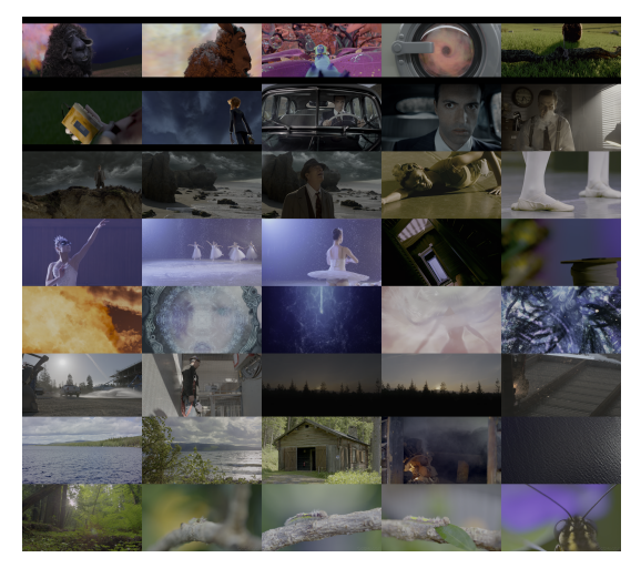
Figure 2: Sample frames from the corpus.