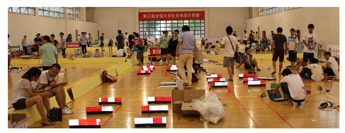
Figure 3. A scene of 3th NUSOSTC in Fuzhou. The students were preparing for the self-navigation car chasing competition.