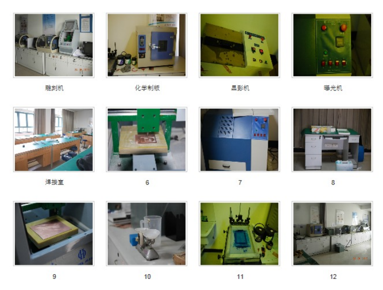
Fig. 2 Equipments for electronic engineering training

During the last two weeks of the freshman summer break, "Opto-mechanical Structure Design" course is arranged. In this course, the students learned to design a simple opto mechanical structure independently, and completed a simple project design. By completing this project design, students had the opportunity to learn how to use general mechanical design software, such as SolidWorks, to carry out real mechanical structure design.