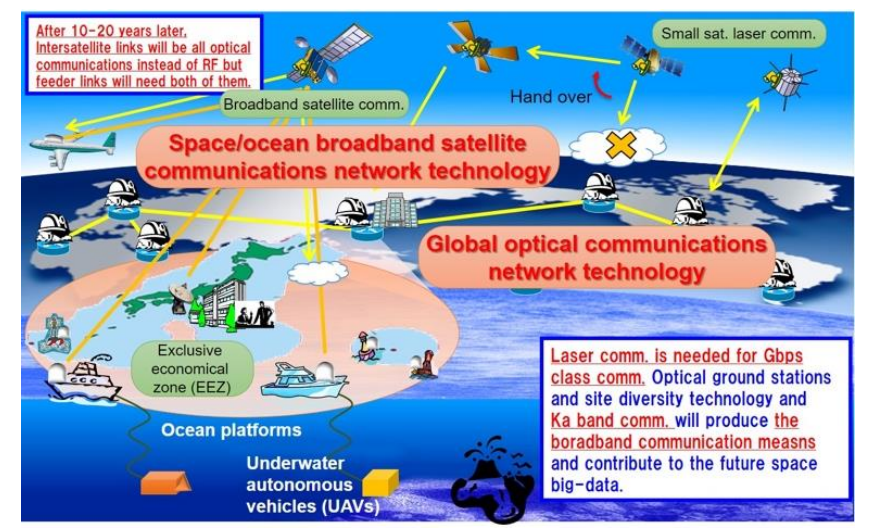
Figure. 1. Overview of the R&D activities of the NICT's Space Communications Laboratory.

We are currently developing a laser-communication terminal called "HICALI", with the goal is to achieve 10 Gbps-class space communications in the 1.5- \mu m band between Optical Ground Stations (OGSs) and the next generation high-throughput satellite (called ETS-IX) equipped with a hybrid communication system using radio and optical frequencies, which will be launched into the geostationary orbit in 2021. The development of the test and breadboard model for HICALI has been conducted for several years and we are now carrying out an engineering model as well as designing the OGSs segment.