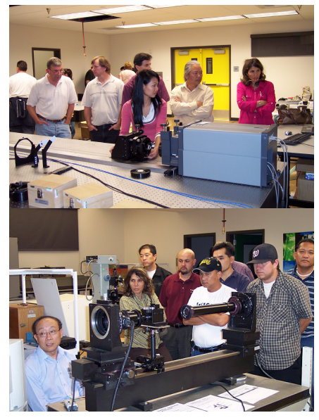
Fig. 4. Photographs showing students and instructors in the Hands-On Labs classes at CACT @ ATEP. Clockwise from the top left. a) Geometric Optics students using the Pasco 8500 Optics Bench, b) Optical Metrology & Interferometry students using a Zygo interferometer, c) Students using an Optical Measurement Bench with a USAF 1951 Resolution Target, d) Instructor demonstrating an Ealing MTF OpticalMeasurement Bench.