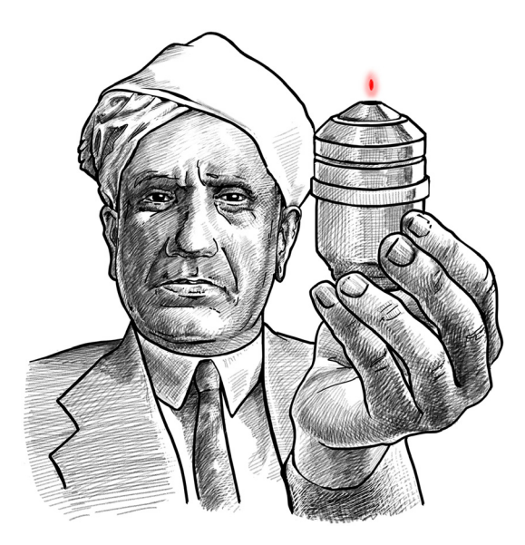
Fig. 2 Raman-based imaging, here symbolized by C. V. Raman holding a high numerical aperture lens, combines the molecular selectivity of the Raman effect with the high resolution of optical imaging (drawing by Potma). Coherent Raman imaging has significantly improved the speed of the Raman-based imaging, opening up the technique to a myriad of biomedical imaging applications.